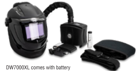
DW7000XL comes with battery powered air respirator.